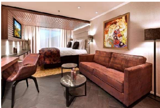
Category SA – Outside Balcony 355 square ft. Double Occupancy $9,395.00