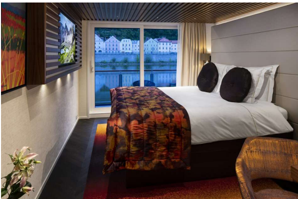
Category AB – Outside Balcony 252 square ft. Solo Only $12,895.00 Double Occupancy $8,595.00