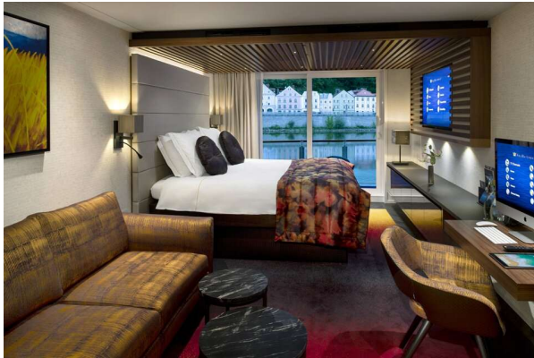
Category SB – Outside Balcony 355 square ft. Double Occupancy $9,195.00/person