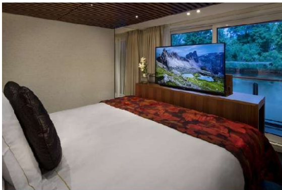
Category OS - Owner's Suite 710 square ft. Double Occupancy $13,195.00