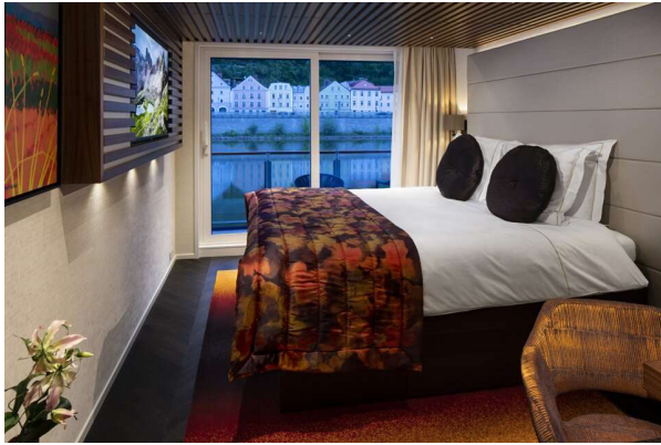
Category AA - Outside Balcony 252 square ft. Double Occupancy $8,795.00/person