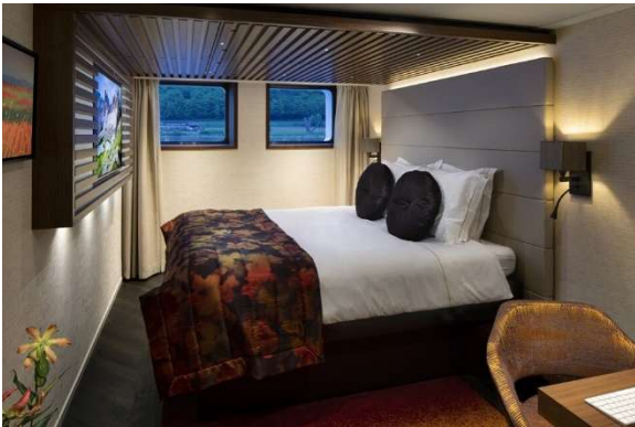
Category D – Fixed Window 205 square ft. Solo $10,949.00 Double $7,599.00