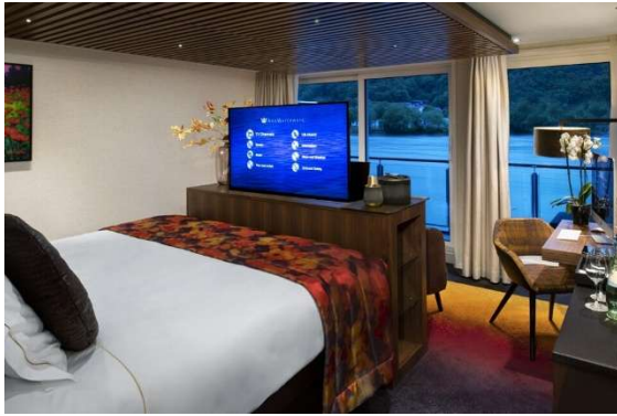
Category GS – Grand Suite 474 square ft. Double Occupancy $11,595.00